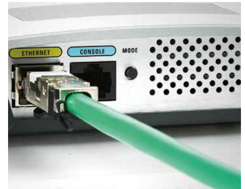
Fig. 3: Direct connection of a network device

This means that usually an additional installation cable specifically for this device has to be drawn to connect a WLAN access point. In this case, you therefore have a cable and precisely one device that has to be connected to this cable. Here, preference is then given to installation without wall outlets. For this purpose, a RJ45 plug is simply installed directly on the installation cable, thus enabling a direct connection of the access point.