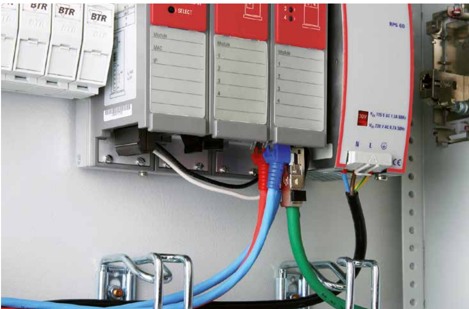
Fig. 5: Direct connection in the industry distributor

the smooth running of the control system, actuators must react in a foreseeable time. The communication must be strictly deterministic and thus capable of working in real time. Ethernet with the TCP/IP protocol is initially not envisaged for this. Nevertheless, it appears attractive to use low-cost Ethernet mass ware and to benefit from the huge bandwidths of up to 10 GBit/s. Various approaches have developed over the last years to make standard Ethernet capable of real time which are all to be assigned under the generic term "industrial Ethernet". The most well-known examples of this are Profinet, Ethercat, Ethernet/IP and Ethernet Powerlink. Although they are fundamentally different, these systems make one thing possible: IP communication between machines and control units of industrial production. Here, giving each communication participant its own wall outlet today is an impossibility not least due to the restricted space available. The direct connection of the installation cables is the one useful approach.