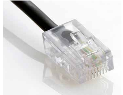
Fig. 1: RJ45 connector plug

but more and more applications are using it. Reason enough to examine the RJ45 and its environment more closely, to dispel wrong ideas, highlight new scenarios for us and to take a look at the latest technical developments.