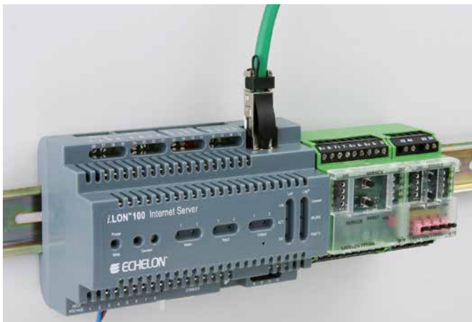
Fig. 4: Direct connection in building automation

Most of these devices are firmly installed behind wall and ceiling claddings or in the flooring and thus invisible to users of the room. In most cases, so-called room operation devices are the only indication of all the hidden technology in use. The communication between the devices is done mostly via building automation buses, such as LON, BACnet or also KNX. More and more manufacturers are changing over to integrating an Ethernet RJ45 connection in their devices, alongside the communication interface for the corresponding bus. They are thus opening up for themselves the integration in the IP communication of the LAN, which facilitates external access