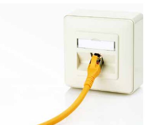
Fig. 2: RJ45 connector plug