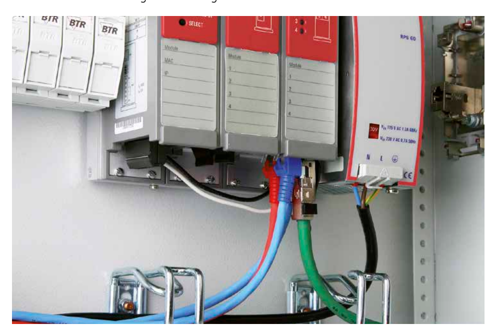
Fig. 5: Direct connection in the industry distributor

on of Ethernet interfaces, these intrinsically closed systems open up and permit a consistent communication from the office to the individual machine for the first time. Communication of the individual machine parts is the basic requirement for the actual task of automation. To ensure