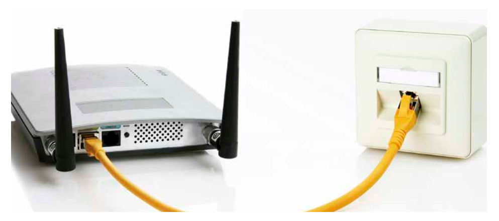
Fig. 2: RJ45 connector plug

Network cabling today is no longer used just to connect office communication devices. An increasing number of application areas for communication connection via Ethernet are being opened up.Application areas in which the end devices are not flexible geo-