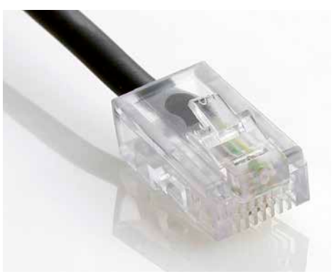
Fig. 1: RJ45 connector plug

but more and more applications are using it. Reason enough to examine the RJ45 and its environment more closely, to dispel wrong ideas, highlight new scenarios for us and to take a look at the latest technical developments.