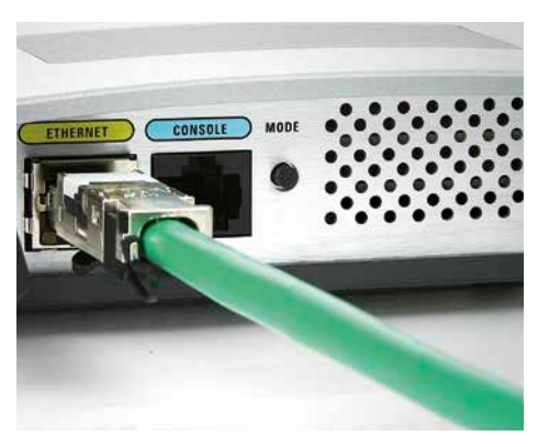
Fig. 3: Direct connection of a network device

This means that usually an additional installation cable specifically for this device has to be drawn to connect a WLAN access point. In this case, you therefore have a cable and precisely one device that has to be connected to this cable. Here, preference is then given to installation without wall outlets. For this purpose, a RJ45 plug is simply installed directly on the installation cable, thus enabling a direct connection of the access point.